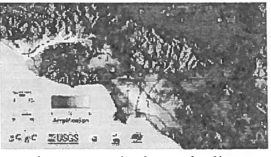
a given magnitude and distance.

New for summer 2001 is the availability of the SCEC Phase III Amplification poster. The two most important factors influencing the level of earthquake ground motion at a site are the magnitude and distance of the earthquake. A new wall poster (30" x 36", $10) shows the influence of a third important factor, the site effect, where conditions at a particular location can increase (amplify) or decrease the level of shaking that is otherwise expected for (http://www.scec.org/outreach/products/index.html)